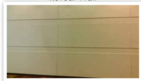
Media Wall at Westin